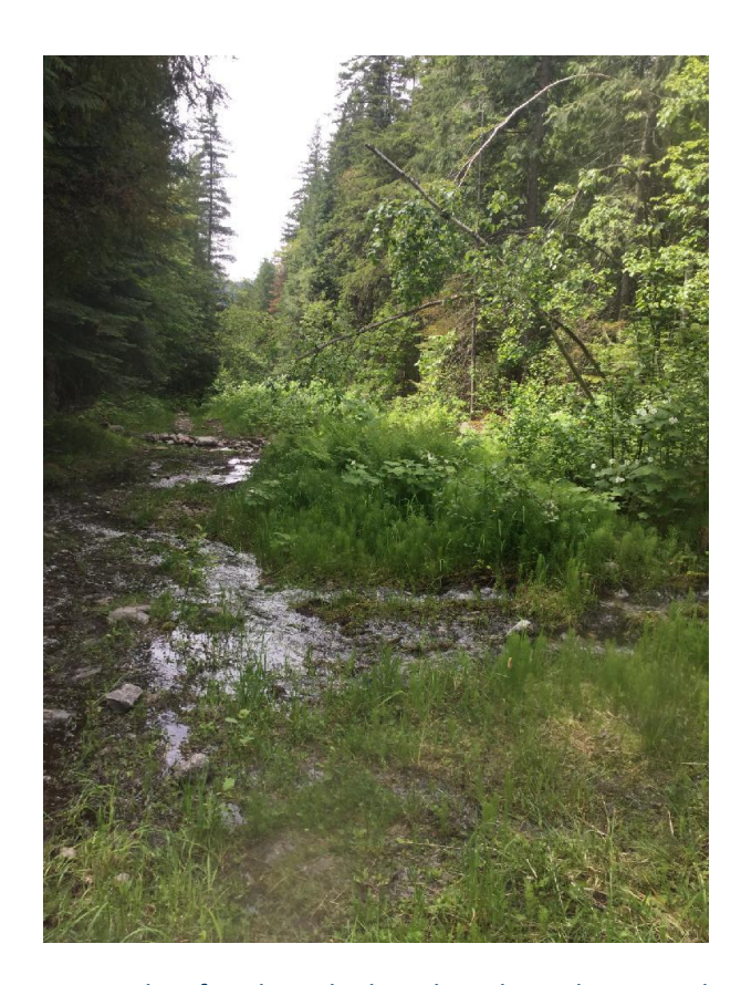
Creeks often have high archaeological potential