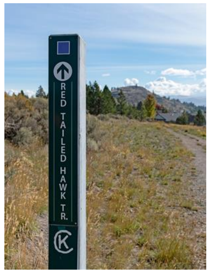
Red Tailed Hawk Trail sign in Kenna Cartwright Nature Park