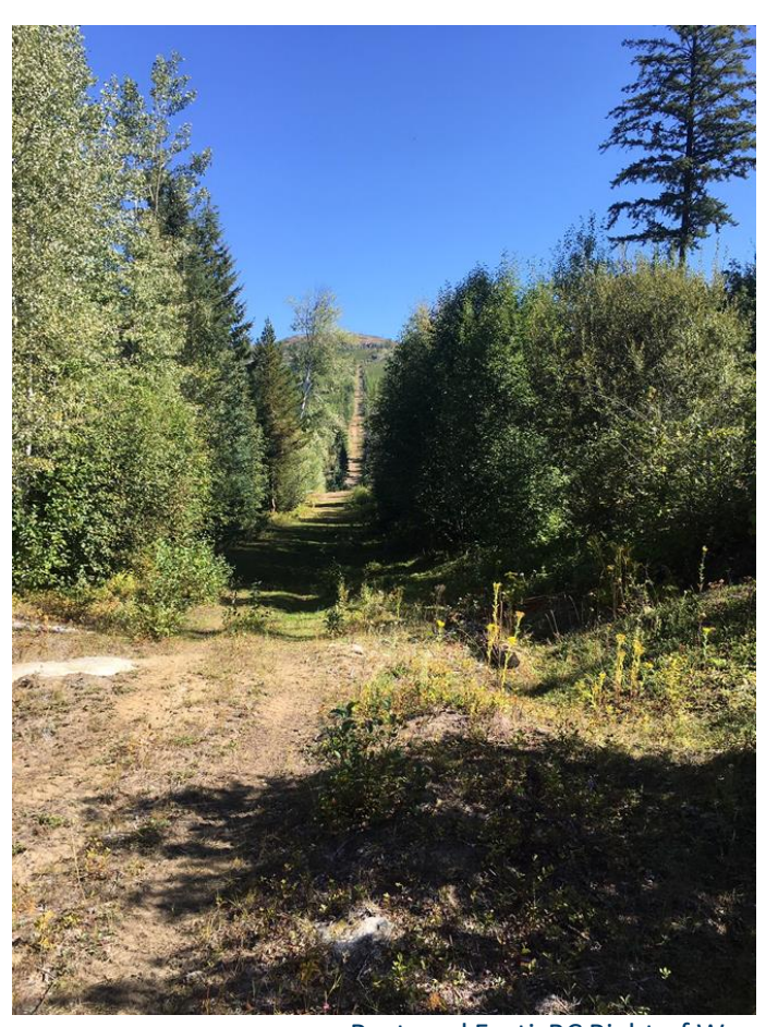
Restored FortisBC Right of Way