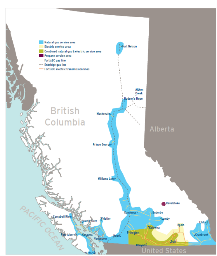
FortisBC area of operations