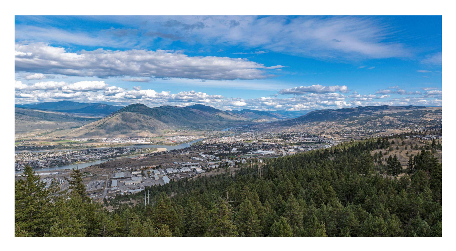
Kamloops Virtual Information Session November 24 and 25, 2021